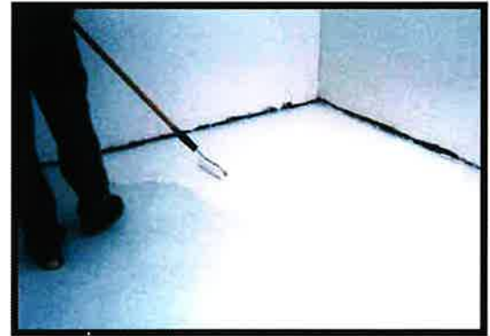
Damp proof treatment for concrete slabs.

During the curing phase, 1-800-BUSYDOG BT Hydro-Crete™ Sealer polymers cross-link to create a macromolecule of extreme durability to provide optimum resistance, severe below grade hydrostatic pressure, and other environmental conditions.