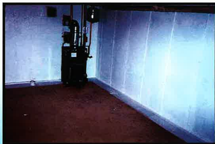
Sealed basement walls used with Water Trek system on floor.