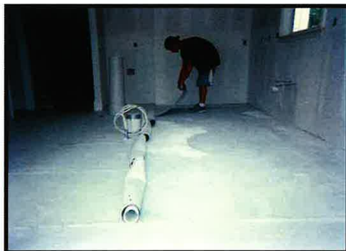
Concrete slab protection used with Water Trek system.