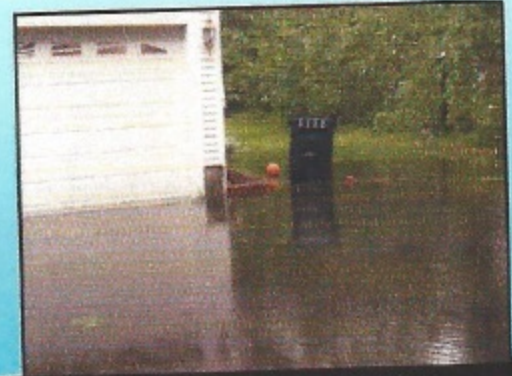
WITH BASEMENT TECHNOLOGIES' "CURTAIN DRAIN™", WATER IS DIVERTED FROM THE HOME TO ANOTHER AREA OF YOUR LAWN.