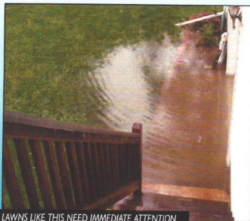
LAWNS LIKE THIS NEED IMMEDIATE ATTENTION.

We always recommend our patented, interior system, The Water Trek Aqua Route®, be installed in conjunction with the exterior " Curtain Drain™ ".