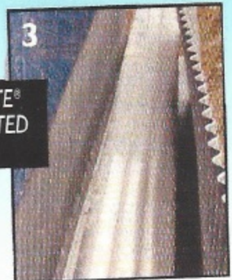
2 THE WATER TREK AQUA ROUTE® IS INSTALLED IN THE PROTECTED TRENCH