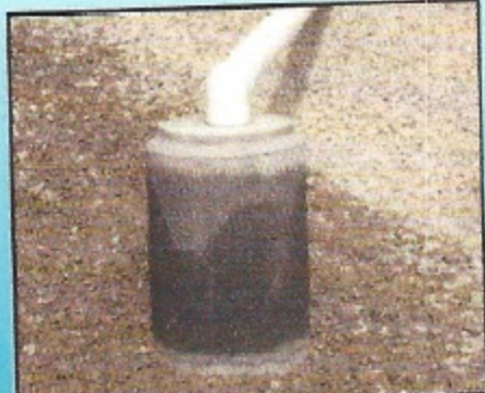
THE LAWN MAGNUM™, DESIGNED BY BASEMENT TECHNOLOGIES AND A CANADIAN ENGINEERING FIRM, CAN DISPENSE MOST WATER UNDERNEATH THE LAWN.