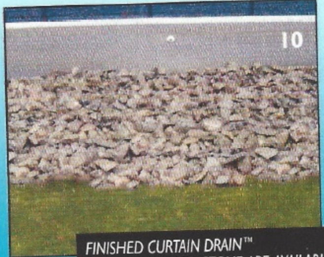
10 FINISHED CURTAIN DRAIN™ VARIOUS COLORED STONE ARE AVAILABLE