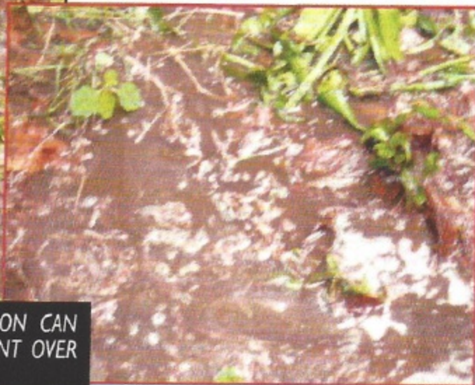
FLOODING BY THE FOUNDATION CAN OVERFLOW INTO THE BASEMENT OVER THE FOUNDATION WALL.

Our " Curtain Drain™ " system is an economical and effective system for added peace-of-mind. In addition, we can install our Finish White™ panels to the inside basement walls which would allow water to flow behind them so that the water will be re-routed into a full perimeter system beneath the floor on the inside.