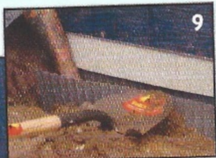
8 9 THE TRENCH IS BACKFILLED WITH DIRT ONCE THE CURTAIN DRAIN™ SYSTEM IS INSTALLED.