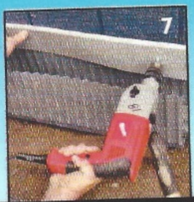
6 7 A SPECIAL "COVER PIECE" IS INSTALLED OVER THE TRENCH PROTECTOR STOPPING WATER FROM GETTING TO THE SILL PLATE.