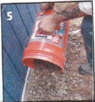
4 5 STONE IS BACKFILLED INTO THE CURTAIN DRAIN™ SYSTEM. GREY IS THE STANDARD COLOR USED, BUT WHITE OR OTHER COLORS CAN BE SUBSTITUTED UPON REQUEST.